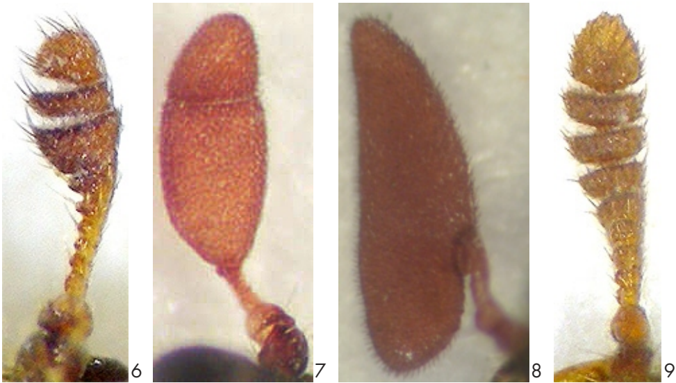
Figs. 6-9. Antennae: 6- Caccoleptoides Herrmann, Háva & Kadej, 2015; 7- Cryptorhopalum Guérin-Ménéville, 1838; 8- Thaumaglossa Redtenbacher, 1867; 9- Caccoleptus Sharp, 1902.